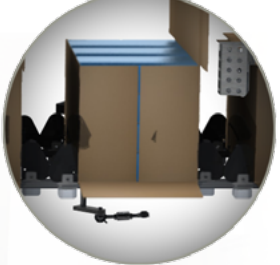
Flight spacing (optional) and motion