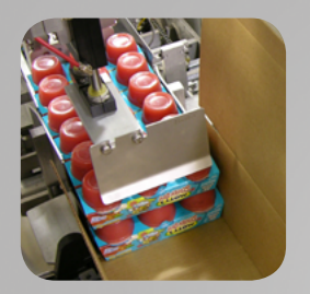
Up stacker, Down stacker